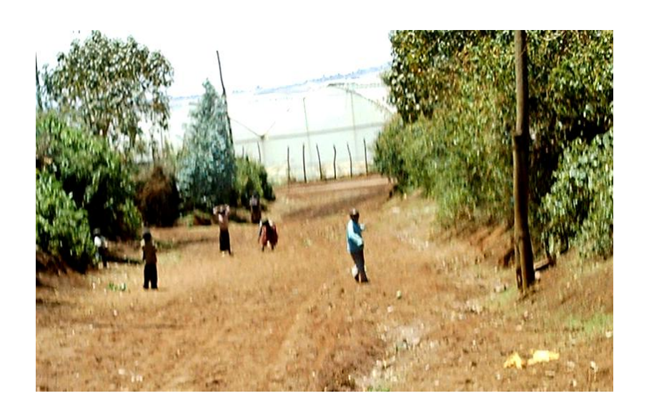
Fig.5. Children Busy at their Play very close to floriculture farm fence