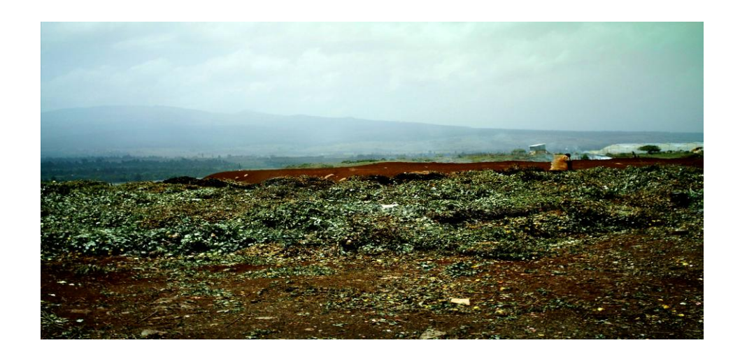
Fig.6. Poor Dry Waste Management in one of Floriculture Farms