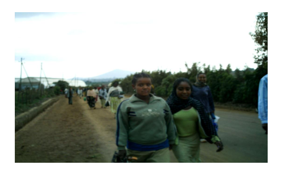
Fig.2. Laborers (women's) back home from work

The study result of Ethiopian Ministry of Trade and Industry in the year 2006 indicates that, until April 2006, the floriculture industry created 21,356 job opportunities for both skilled and unskilled personnel on 321.3 hectares of floriculture coverage. In the year 2004 it only created jobs for 3,000 people on 150 hectares of floriculture land cover.