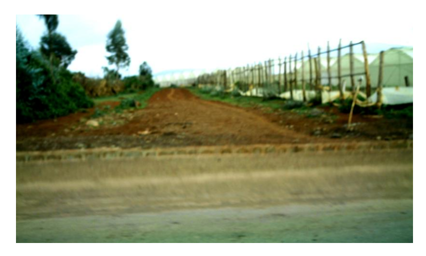
Fig.4. The Road Between Nearby Village and Floriculture Farm Greenhouses